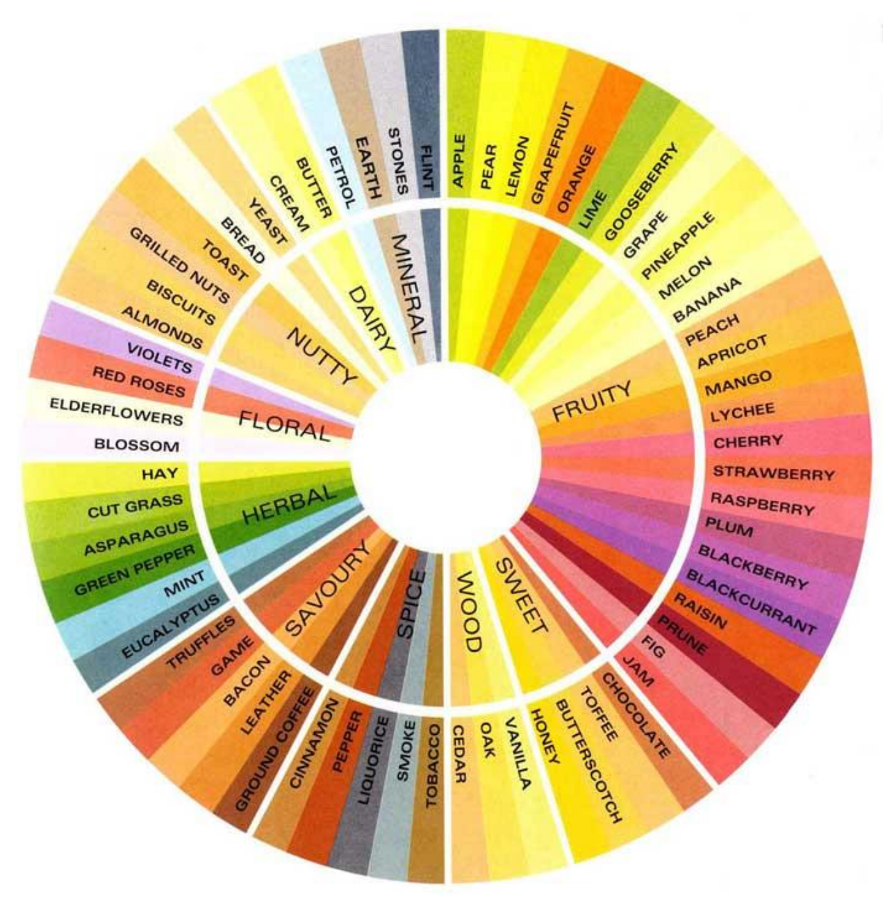
Wine Flavor Wheel (Not widely adopted)